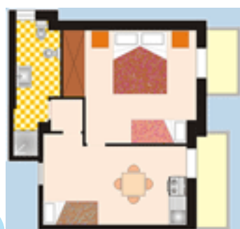
Apartment 4 beds