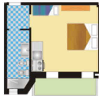
Apartment 3 beds