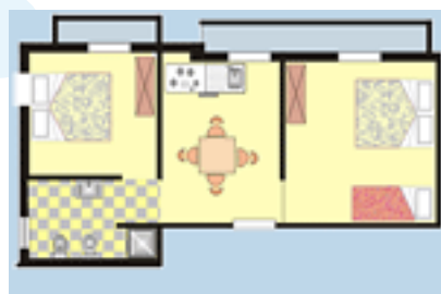
Apartment 5 beds