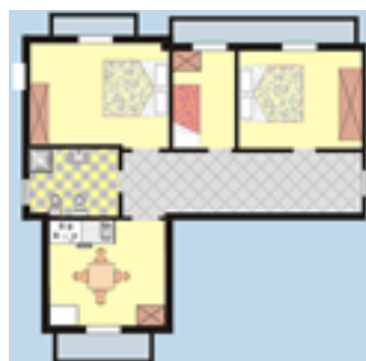
Apartment 6/8 beds