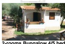
2-rooms Bungalow 4/5 beds

BRICK BUNGALOW 3-ROOMS 6 PEOPLE (40 m 2 ) Living room with kitchenette, main bedroom with double bed, bedroom with 2 bunk beds, bathroom with shower, decked veranda.