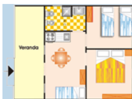
Semi-detached lodge 5/6 beds B6-B7 In front of the beach