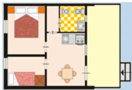
Semi-detached lodge 4 beds