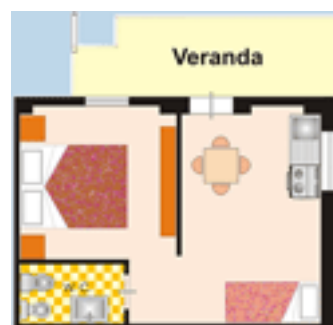
Bungalow 4 beds