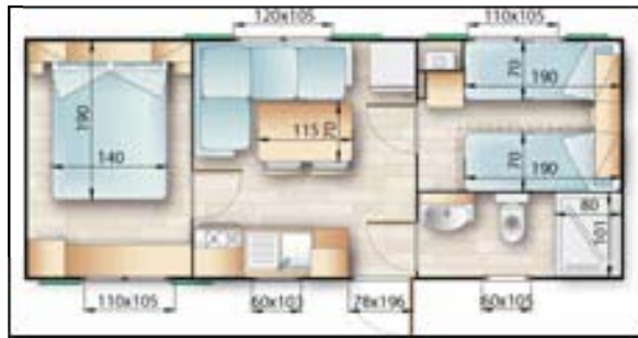
Mobile Home 4 beds B33 - B40 in front of the beach